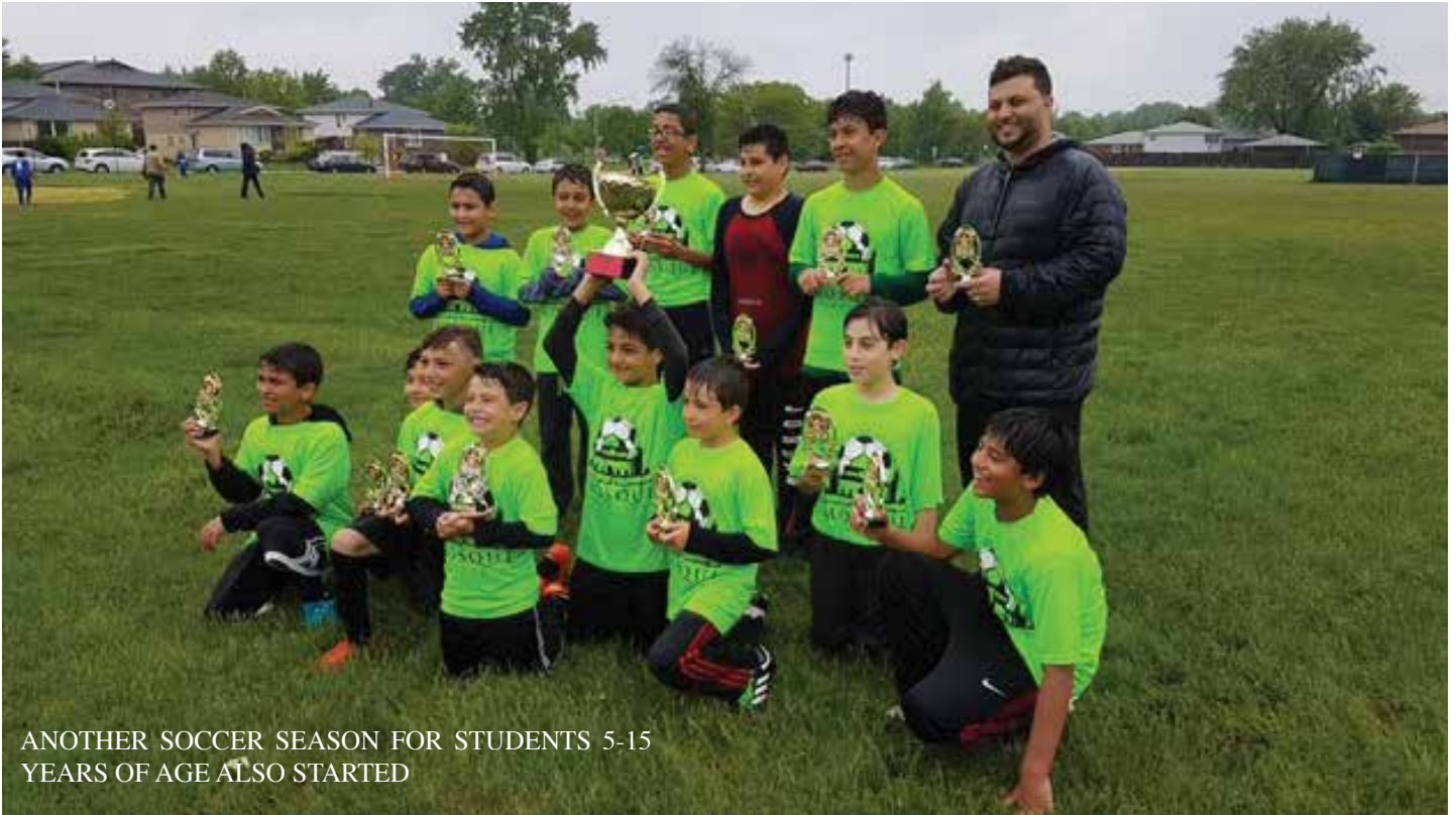
ANOTHER SOCCER SEASON FOR STUDENTS 5-15 YEARS OF AGE ALSO STARTED

Basketball tryouts were held on October 8th to choose the best players to join our basketball team for this year.